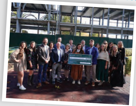
KEENELAND EMPLOYEE SCHOLARSHIP PRESENTATIONS