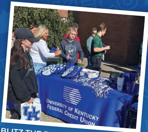
BLITZ THE BLUE

OFFICIAL CREDIT UNION of THE UNIVERSITY OF KENTUCKY