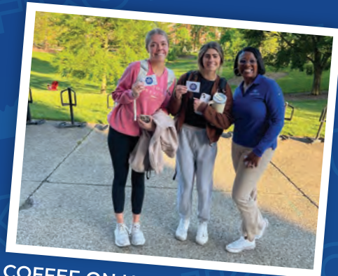
COFFEE ON US