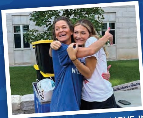
BIG BLUE MOVE-IN

In 2024, through special initiatives like Big Blue Move-In, Blitz the Blue, and Coffee on Us during finals week, we loved connecting, engaging, and supporting the thousands of students on the University of Kentucky campus.