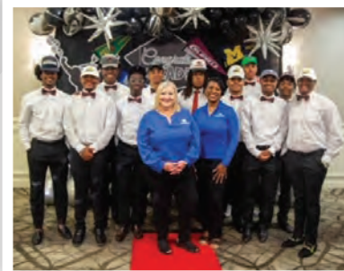
BMW ACADEMIC SIGNING DAY