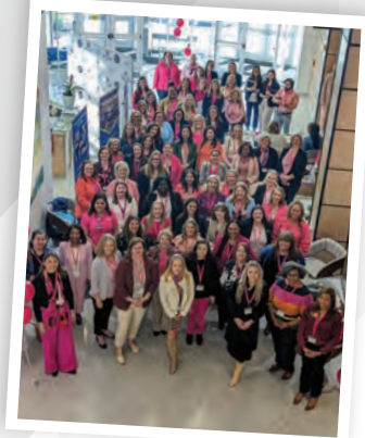
JA MISS BUSINESS