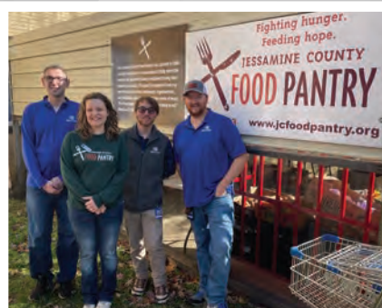
JESSAMINE COUNTY FOOD PANTRY