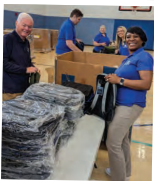
YMCA BACKPACK STUFFING