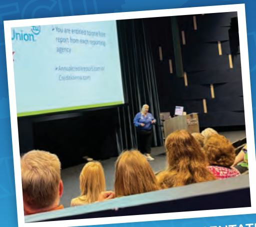
COLLEGE OF DENTISTRY PRESENTATION