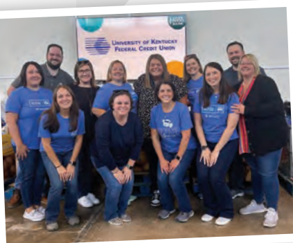
GOD'S PANTRY FOOD BANK