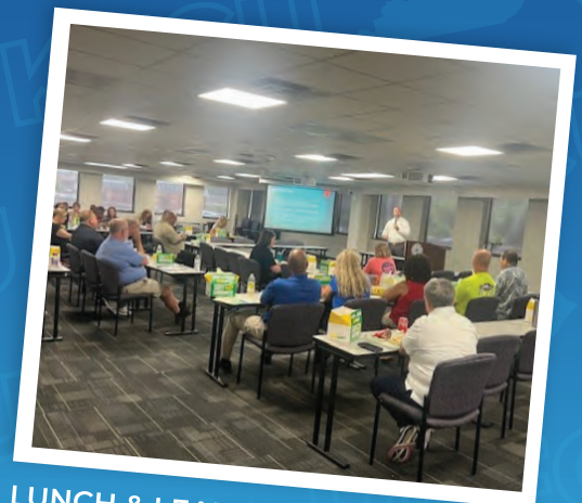
LUNCH & LEARN