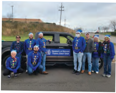
JESSAMINE COUNTY SAINT NICH FEST